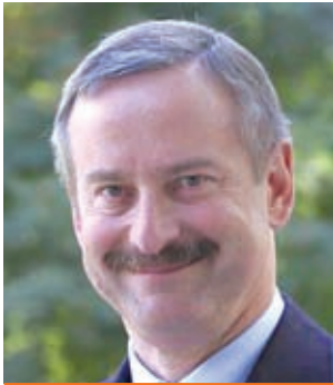
by Vice President Siim Kallas Member of the European Commission responsible for Administration, Audit and Anti-Fraud

This survey will be of interest to members of the lobbying profession. Indeed, officials in EU institutions and Member States interviewed for the survey have revealed how they take decisions, including whom they trust for information and expertise. This gives the lobbyists and those with money to spend on lobbying, an insight into what techniques and channels are most effective.